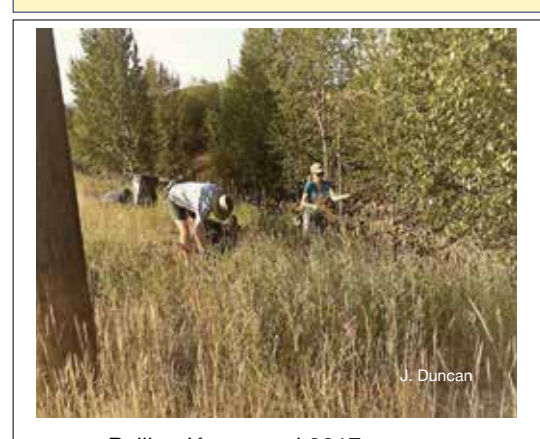
Pulling Knapweed 2017